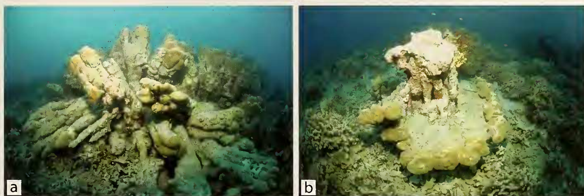
Figure 13. (a) Split Porites sp. colony and (b) overturned Porites sp. colony at 4 m water depth, Teluk Balohan, Pulau Weh, October 28, 2005.